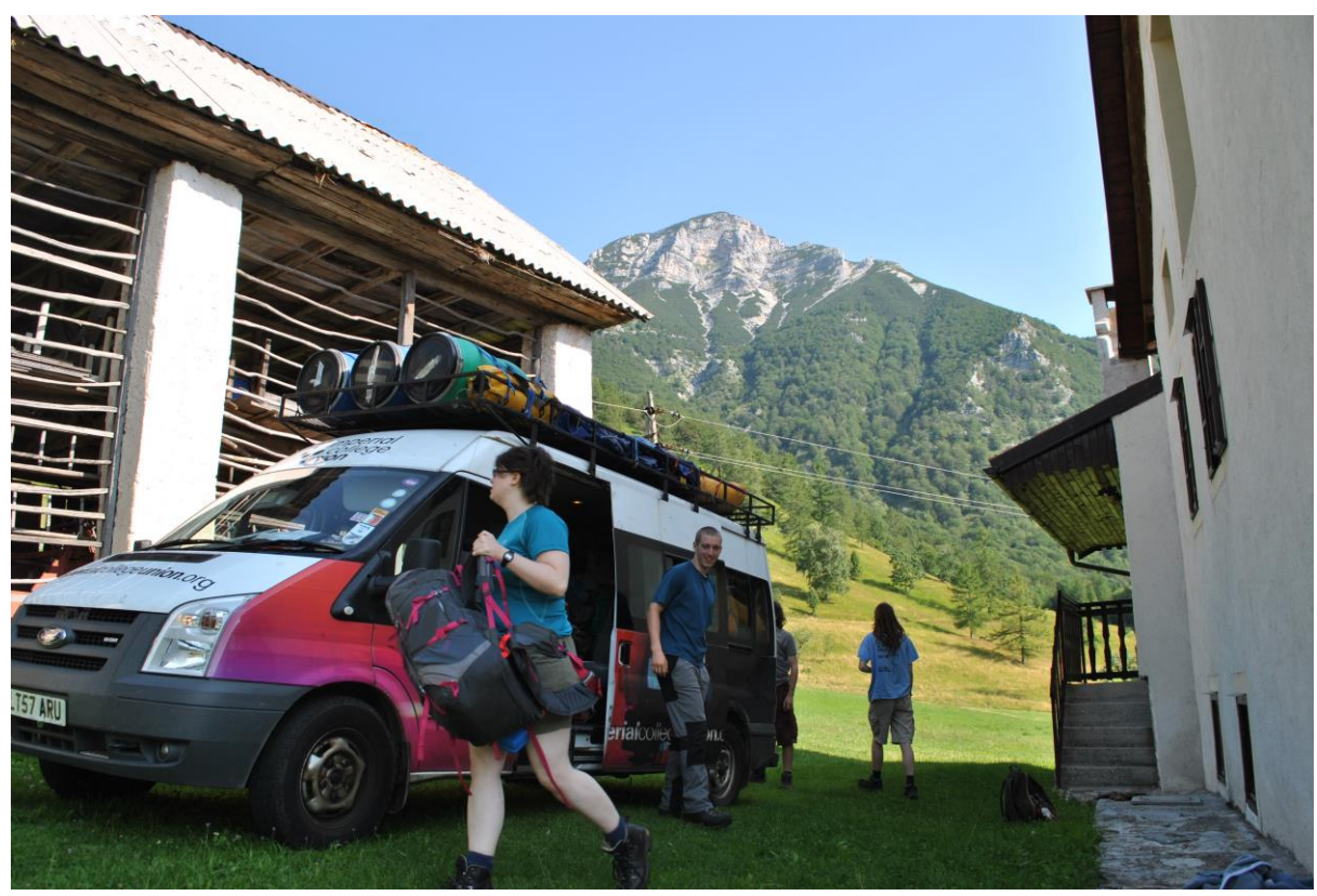
'Unpacking the van with Migovec in the background'

18 cavers travelled out from the UK. Nine travelled with the equipment in a union minibus with the rest making their own way.