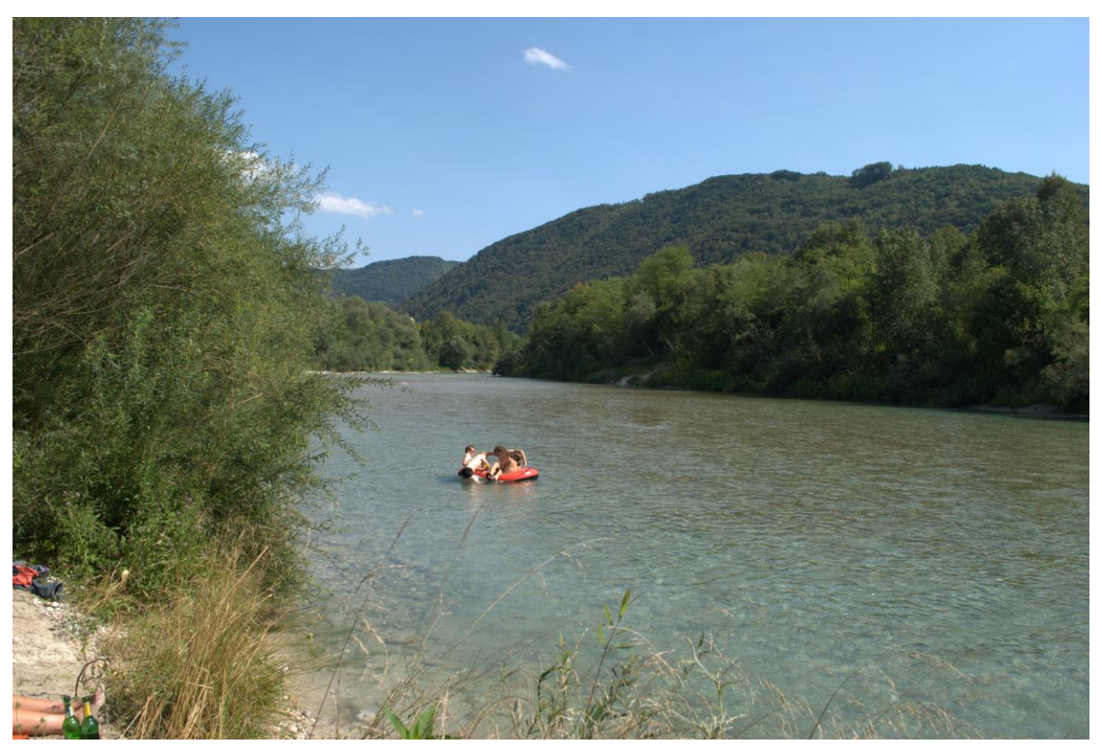
'The Soča river'