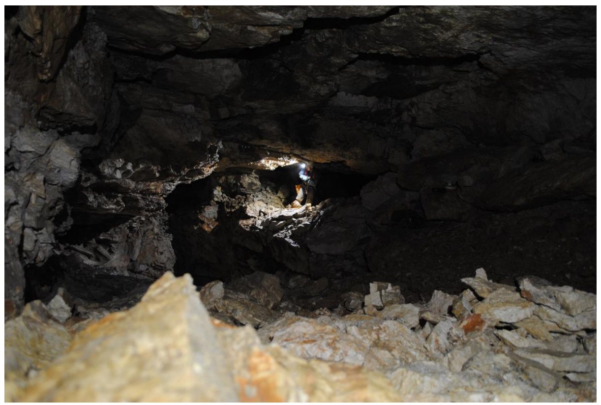
'Chamber in Jailbreak'